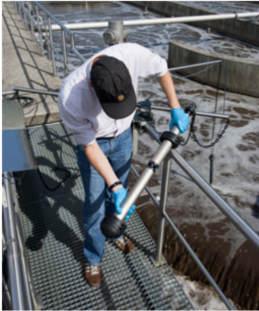
Figure 4. UV Vis sensors are low maintenance.

This system uses an air compressor to periodically force pressurized air over the optical windows, removing any solids that could disrupt the measurement. The YSI air blast system links directly to the sensor and is programmable within the controller to clean at a desired interval. Both automatic cleaning systems are capable of keeping sensors reading accurately for several weeks within wastewater applications.