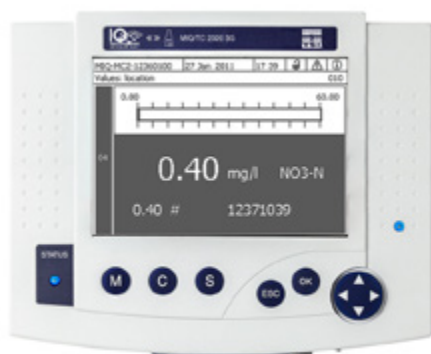
IQ SensorNet 2020 3G controller displaying NO x sensor measurements

The single-wavelength and spectral sensors both provide benefits, so which is best for your application? The single-wavelength sensors can provide trending for organics or NO x at a moderate price, and there are even applications which specifically utilize single-wavelengths sensors, such as UVT-254 for UV disinfection. However, the spectral sensors are calibrated to specific applications (influent, secondary treatment, effluent) and because they scan 256 wavelengths, they provide higher accuracy, higher repeatability, and better correction for turbidity than single wavelength sensors.