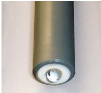
Hemispherical design of new sensor offers surface that is easier to wipe