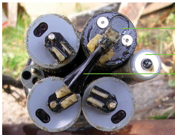
ROX Optical DO Sensor

Longer lasting sensor saves you time and money