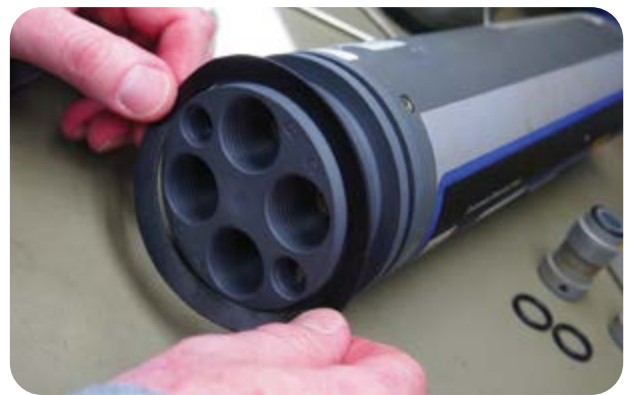
Bulkhead seal replacement