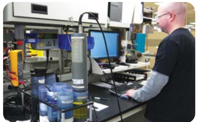
Verification that sensors meet YSI specifications

If additional services apply, they will be quoted at time of service.