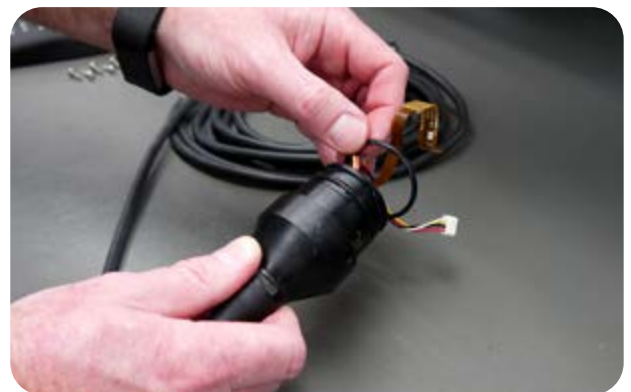
Cable/probe assembly seal replacement