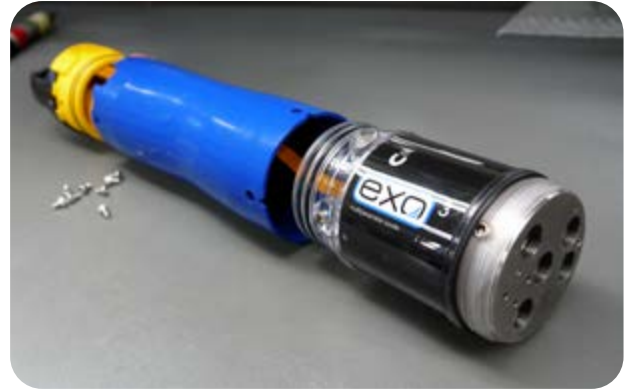
Comprehensive inspection and seal restoration by expert technicians

If additional services apply, they will be quoted at time of service.