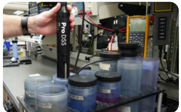
Verification that sensors meet YSI specifications