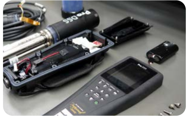
Comprehensive inspection and testing by expert technicians