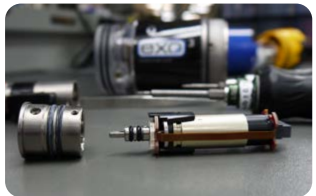
Annual Wiper service is critical to anti-fouling protection