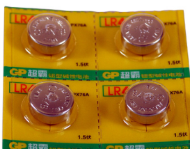
606118 replacement batteries (includes battery cover).