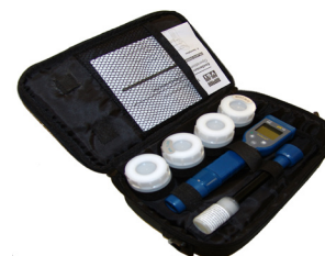
605129 soft carrying case.