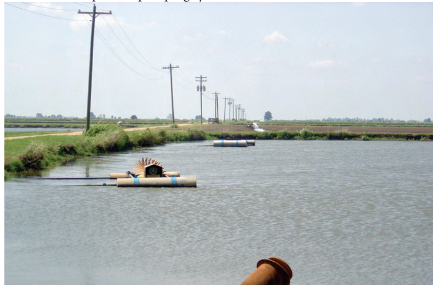
Heavily stocked catfish ponds are a typical application for the YSI 5567.

The wiper/stirrer assembly is designed to eliminate the need for regular maintenance associated with continuous dissolved oxygen monitoring in nutrient rich environments typically found in many outdoor aquaculture applications. The reliable wiping system efficiently removes bio-fouling, algae, and sediment from the probe's membrane without the need for chemicals or expensive pumping systems.