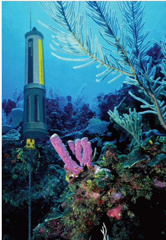
YSI sonde deployed near a coral reef for long-term data collection.

of flushing accumulated sediment approximately four times per year. Unfortunately, estimates of sediment loads coming from the watershed suggest the Bay bottom is covered nearly eight times per year. Resuspension of sediment during periods of southern wave swell was found to be a substantial problem in the Bay, killing additional corals and preventing larval recruitment. Overfishing of herbivorous fishes has added to the problem due to the overgrowth of sediment-covered substrata with fleshy algae. Recovery of the Bay will require a combined reduction in sediment input as well as establishment of a moratorium on catching herbivorous fishes.