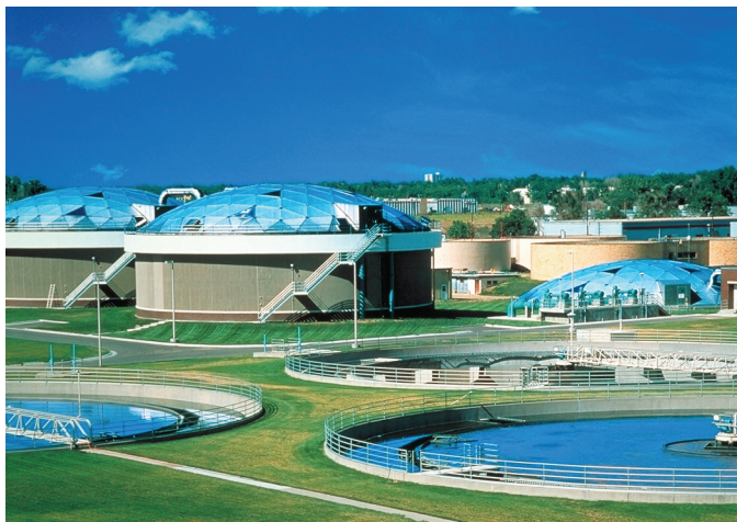
An example of a wastewater treatment plant.

Denitrification is an anaerobic process wherein nitrate is reduced to nitrite, thence to elemental nitrogen, which is liberated to the atmosphere. It is important to note that, although some denitrification can occur aerobically, it occurs intensely under anaerobic conditions. Therefore, by maintaining anaerobic conditions (often termed "anoxic" if nitrate is available) at this phase of treatment, the facility can remove the maximum amount of nitrogen from the waste stream. Key participants in this process include many facultative anaerobic bacteria such as those in the genera Pseudomonas , Achromobacter and Escherichia . By harnessing and intensifying these natural processes, the facility can significantly decrease nitrogen concentrations from the waste stream before treated effluent is discharged to ambient waters.