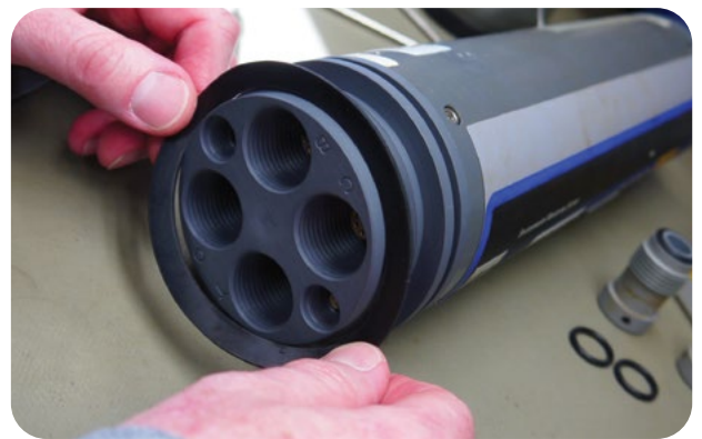
Bulkhead seal replacement