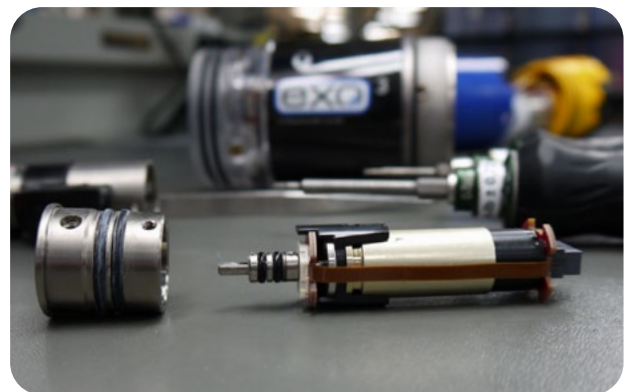
Annual Wiper service is critical to anti-fouling protection