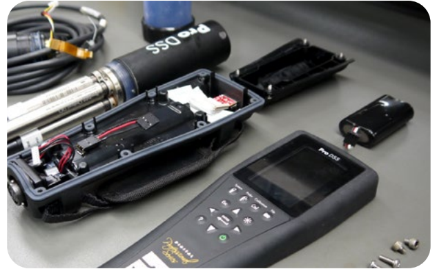
Comprehensive inspection and testing by expert technicians