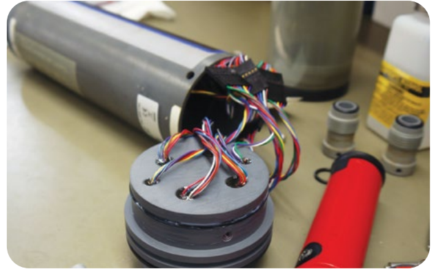
Comprehensive inspection and testing by expert technicians