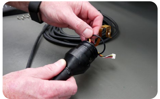
Cable/probe assembly seal replacement