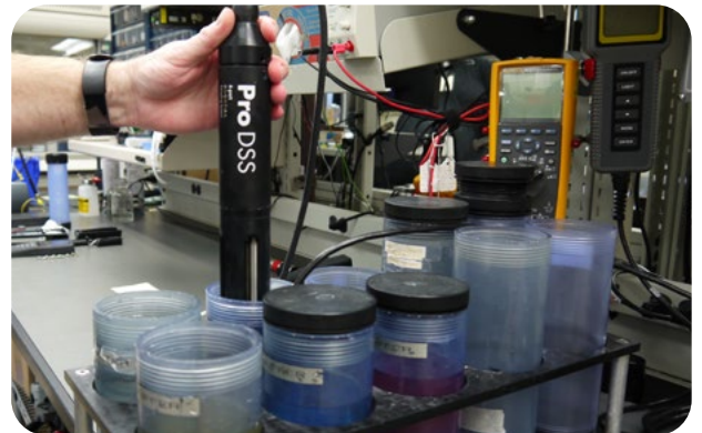
Verification that sensors meet YSI specifications