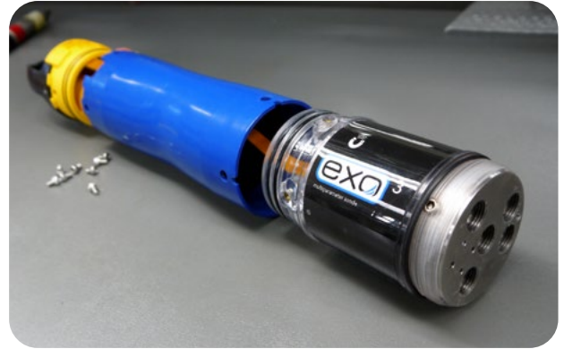
Comprehensive inspection and seal restoration by expert technicians

If additional services apply, they will be quoted at time of service.