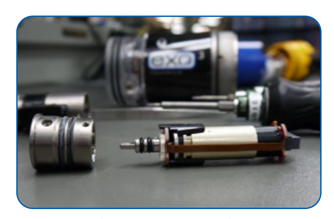
Annual Wiper service is critical to antifouling protection