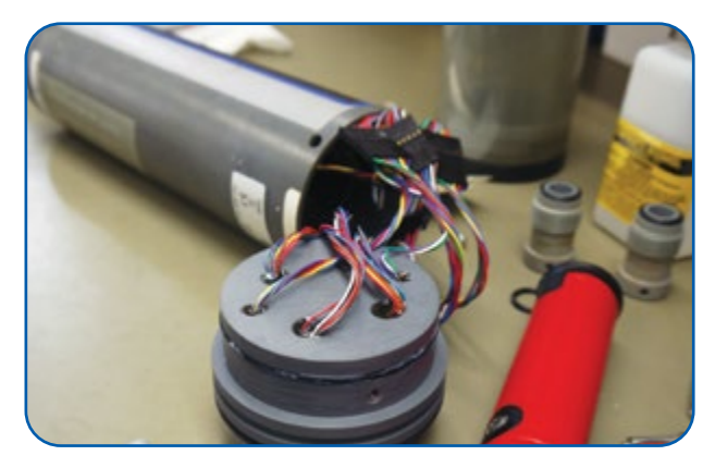
Comprehensive inspection and testing by expert technicians