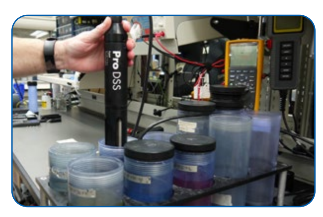
Verification that sensors meet YSI specifications