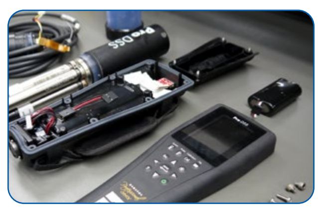
Comprehensive inspection and testing by expert technicians