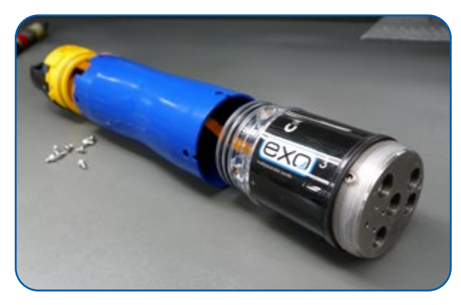
Comprehensive inspection and seal restoration by expert technicians