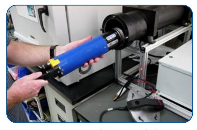
Factory pressure chamber tests leak resistance up to 250m simulated depth