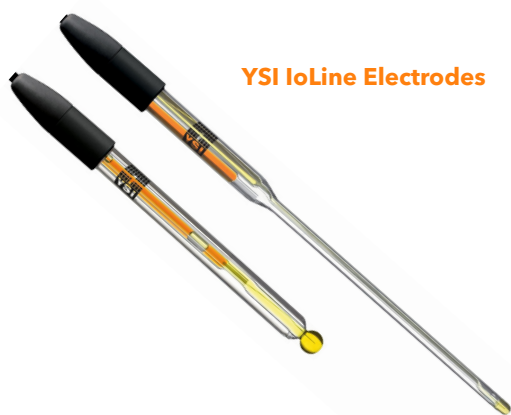
YSI IoLine Electrodes