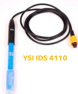
YSI IDS 4110