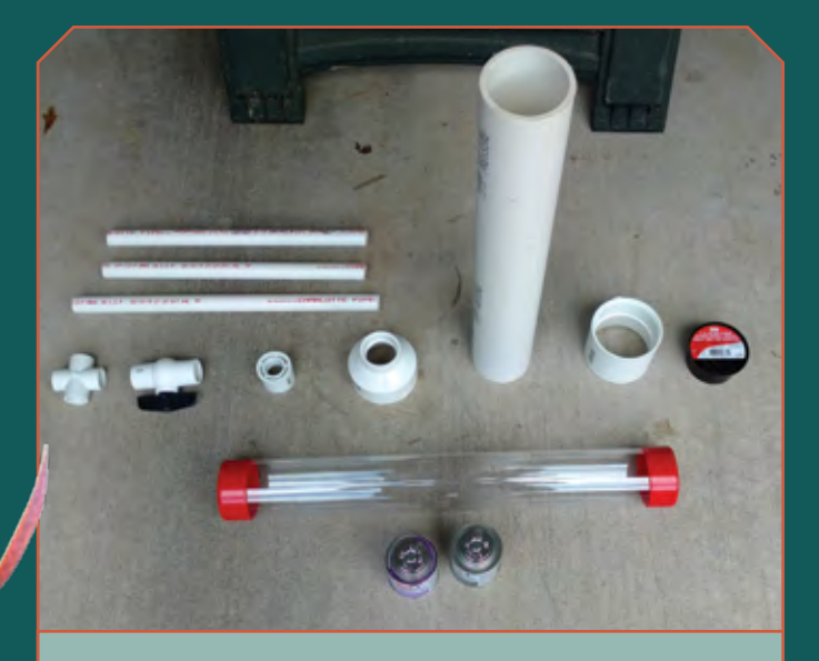
Down to the bottom of his budget, Bret Webb built his own sediment sampler from PVC plumbing parts.

HydroSurveyor mode is optimized for depth measurement, with less emphasis on velocity, and displays real-time and historical data on a map. That makes HydroSurveyor mode better suited for bathymetry. Users specify the package they want when they purchase an M9, and can unlock the other mode if their needs change—for instance, if they need to switch from river measurements to lake bathymetry surveys.