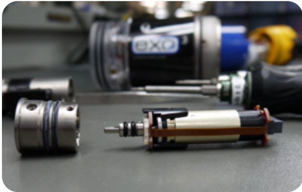
Annual Wiper service is critical to providing the best anti-fouling protection

All work is performed by expert technicians. This includes comprehensive inspection and seal restoration, as well as other services only the factory can provide.