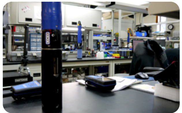
Factory Service Center located in Yellow Springs, Ohio

YSI Incorporated 1725 Brannum Lane Yellow Springs, OH 45387