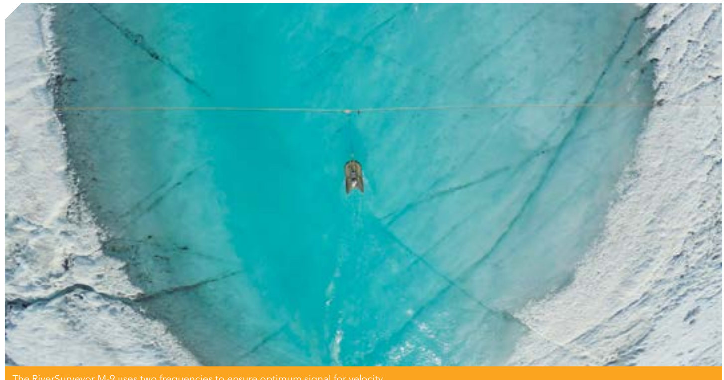
The RiverSurveyor M-9 uses two frequencies to ensure optimum signal for velocity, depth and direction measurements.