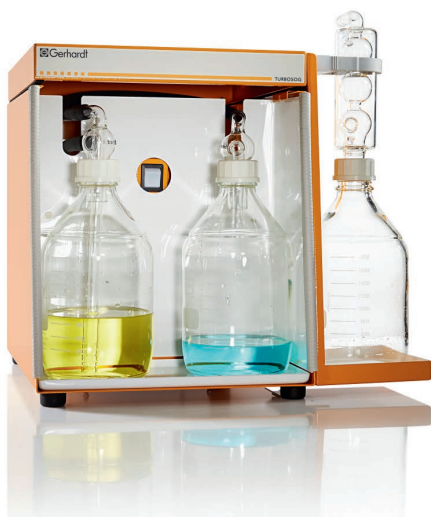
TURBOSOG with additional cooling unit ZKE

Powerful suction washer in tried and tested C- Gerhardt quality for extraction and washing out of the inorganic acid fumes created during digestion.