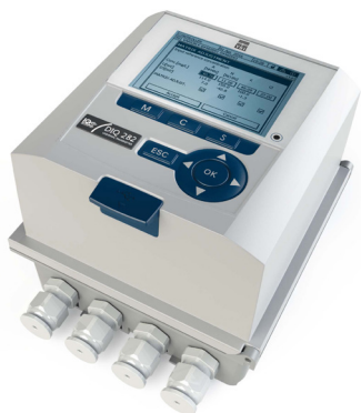
282 Terminal Stacked on Modules