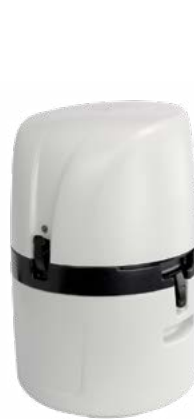
ProSample PM and PM-12