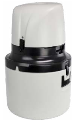
ProSample P and P-12