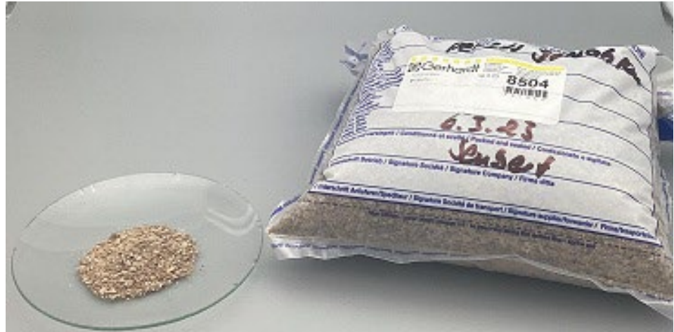
Figure 1: Feed pellets, Laboratory number.: 8504

This application is used for the determination of hydrochloric acid-insoluble mineral components in animal feed. HYDROTHERM is used to digest the ash with hydrochloric acid and to filter out the insoluble residue. This filtration is sometimes very time-consuming and can be significantly shortened and automated by using HYDROTHERM.