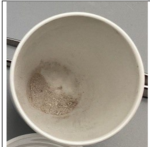
Acid-insoluble ash of beet pellets