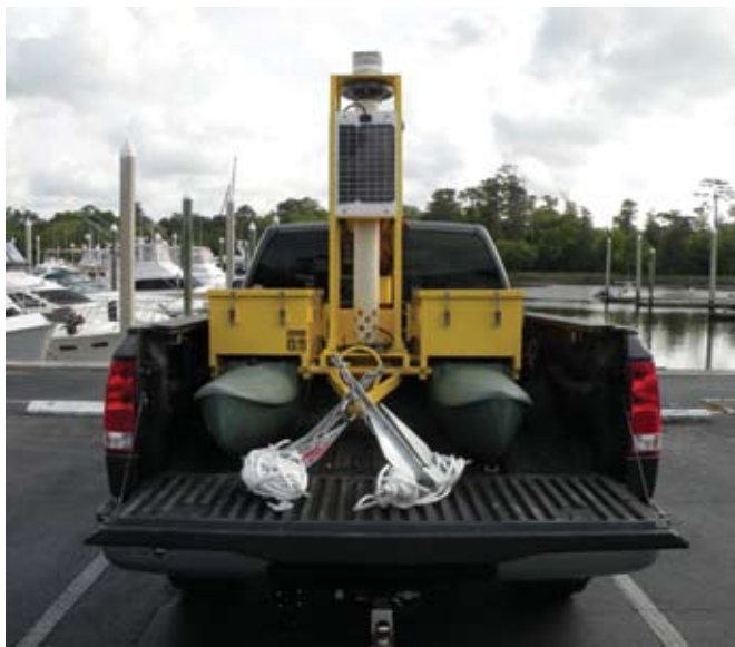
Left: EMM350 is designed to fit between the wheel wells of a full-size pickup truck.