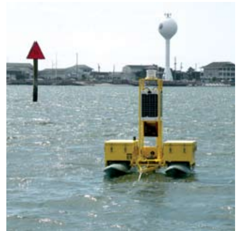
The EMM350 is easy to deploy for monitoring around construction, dredging, and other applications.