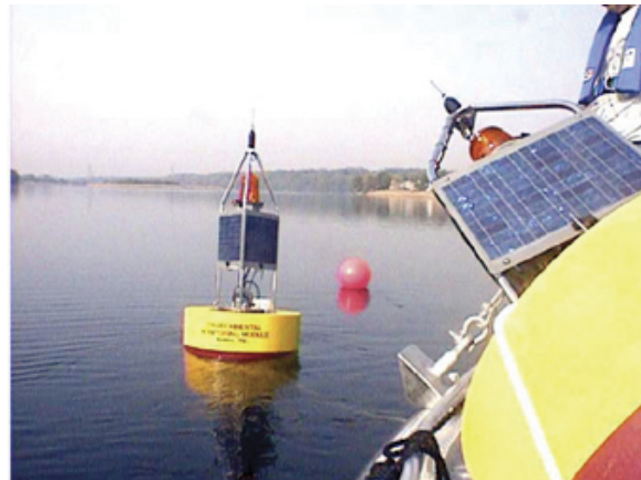
EMM550 Data Buoy deployed upstream of Sikorski Bridge.